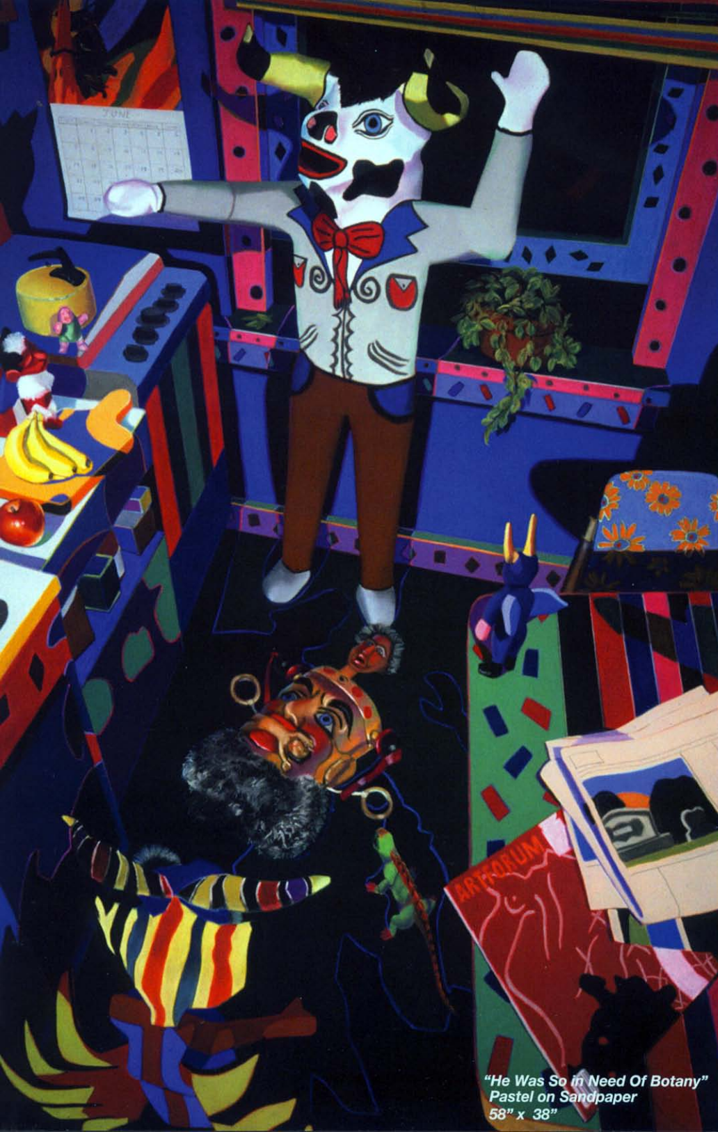
"He Was So in Need Of Botany" Pastel on Sandpaper 58" x 38"