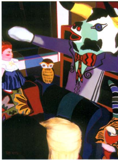
"Scene Sixteen: Living Room" 26" x 20"

"While Rachko's bright colors and unusual subject matter may initially steal your attention, it's her strong drawing skills that give these pastel pieces their punch."