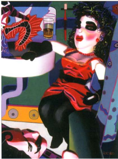
"Scene Thirteen: Bathroom" 26" x 20"