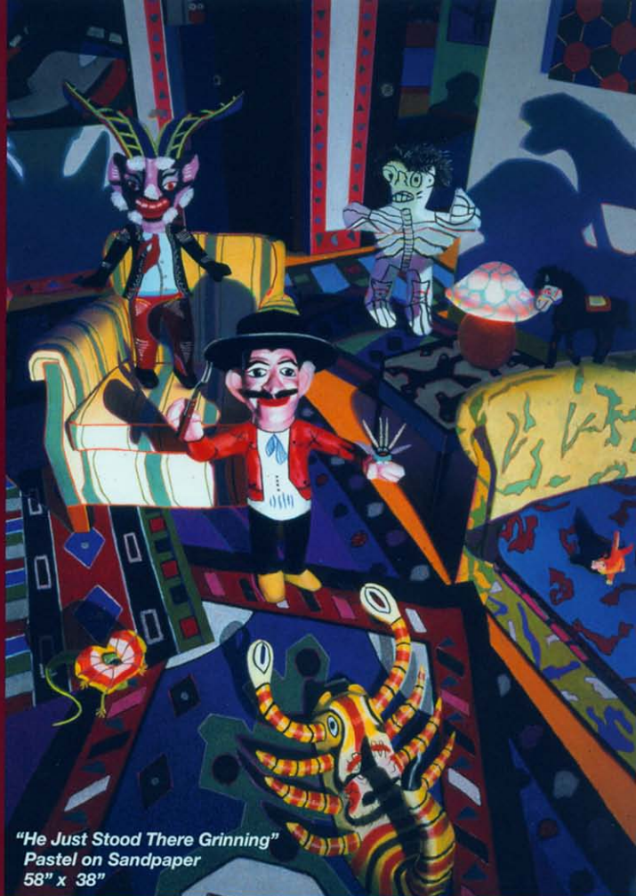
"He Just Stood There Grinning" Pastel on Sandpaper 58" x 38"